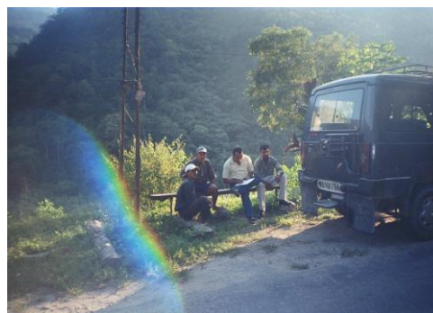
Fig 6.1: View of Community consultation

256. Construction camps may, however, put stress on local resources and the infrastructure in nearby communities. In addition, local people raised construction-process related grievances with the workers. This sometimes leads to aggression between residents and migrant workers. To prevent such problems, the contractor should provide the construction camps with facilities such as proper housing, health care clinics, proper drinking water and timely payment. The use of local labourers during the construction will, of course, increase benefits to local peoples and minimise these problems. Wherever possible, such people should be employed.