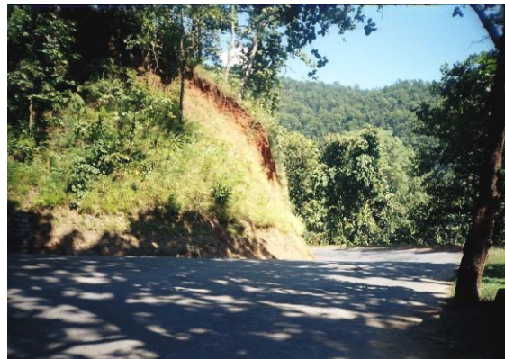
Fig 4.2: Landslide prone location along the road

151. All hill/soil cutting areas should be revegetated as soon as construction activities are completed. At more vulnerable locations, selected bioengineering techniques should be adopted - a combination of bioengineering techniques and hard engineering solutions such as rock bolting and the provision of bank drains may be required. Solutions will, however, need to be individually tailored by the geo-technical/ environmental experts of the Supervision Consultant. Fig. 4.2 shows the typical landslide on project road.