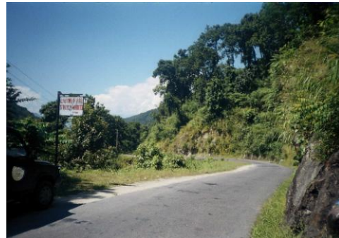
Fig 3.1: Typical Hilly Terrain through Project Road

33. Geographically the state lies in the North-Eastern Himalayas between 27°00'46" to 28°07'48" North latitude and 88°00'55" to 88°55'25" East longitude, and sprawling over 7096sq.km. The state is bounded by vast stretches of Tibetan Plateaus in the north, the Chunbi valley of Tibet and the Kingdom of Bhutan in the east, the Kingdom of Nepal in the West and Darjeeling district of West Bengal in the south. The state account about 3 percent of the total area of the north eastern region and 1 percent in terms of population. About 10 per cent of the land resource is available for economic utilization in terms of agriculture. Figure 3.2 shows the physical map of the Sikkim State.