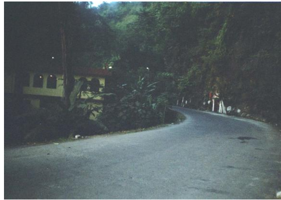
Fig 4.1: Cultural Place at Rolu Village along the road

125. There are no adverse impacts expected on historical places/monuments. However, there are two temples (km 8 and km 25) which are coming within ROW and adjacent to existing carriageway. Care must be taken to avoid any damage to these structures. Also earthworks, as associated with the actual road construction/improvement works, or deriving from secondary sites such as quarries or borrow pits, may reveal sites or artefacts of cultural/archaeological significance. Fig. 4.1 shows the typical temple along the road. In the event of such discovery, the proper authorities should be informed and the requirement to take such action should be incorporated in contract documents.