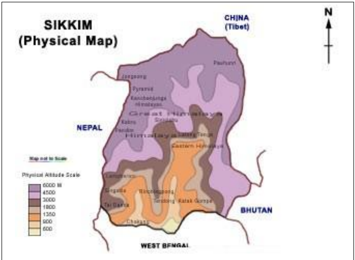
Figure 3.2: Physical Feature Map of Sikkim State